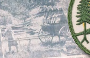
RUSTIC SETTING. —The Long Beach girls found that most of the women and men, but near the entrance of an old cabin the girls climbed aboard a wagon and glimmering over the mountain. The camp is 12 miles from Barrois.