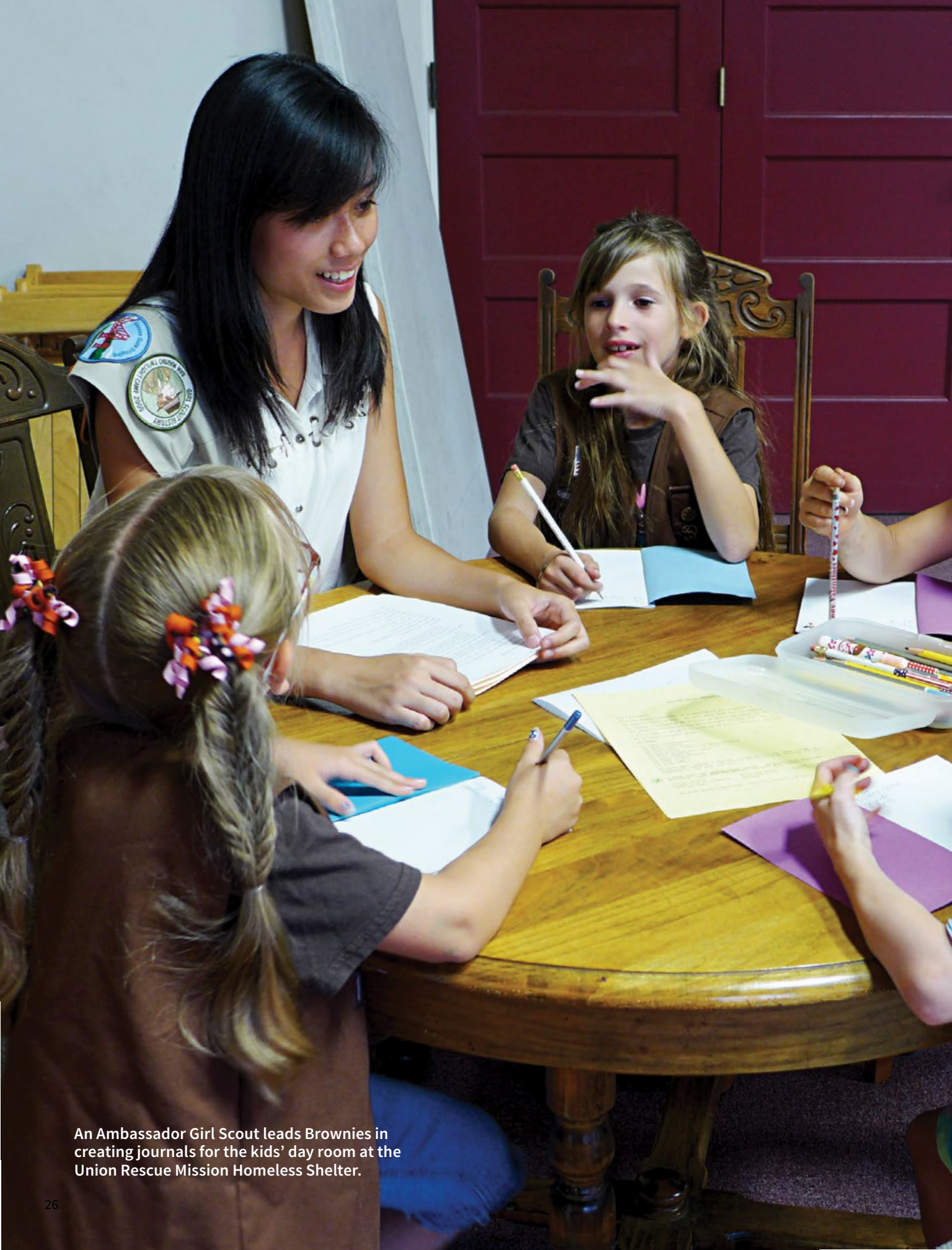
An Ambassador Girl Scout leads Brownies in creating journals for the kids' day room at the Union Rescue Mission Homeless Shelter.