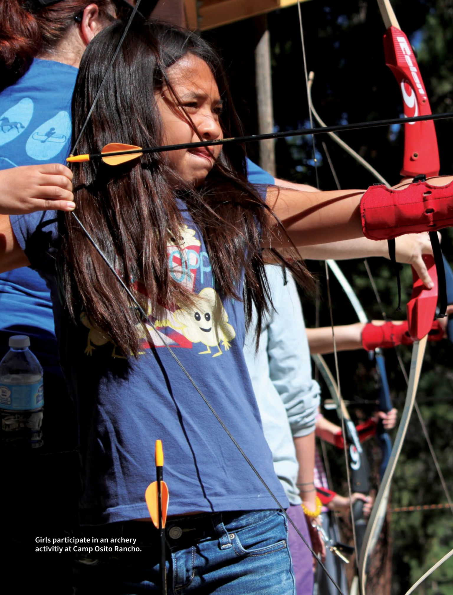
Girls participate in an archery activity at Camp Osito Rancho.